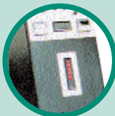
New Bit Pressure Display